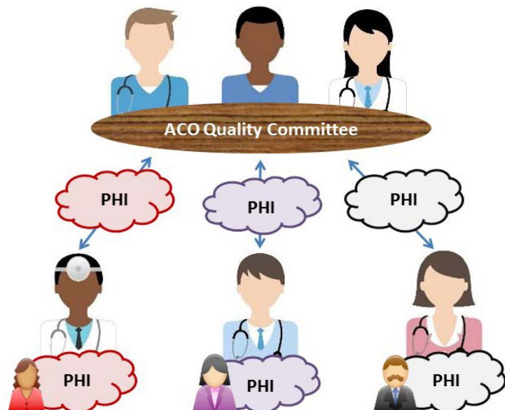
Figure 2: QA/QI ACO Scenario

If the ACO were not operated as an OHCA, or the quality committee was evaluating care quality on behalf of individual providers in the ACO, the providers participating in the ACO could permit the ACO quality committee to access the necessary PHI for the quality assessment through CEHRT, but only for patients whom the requesting and disclosing providers have in common, pursuant to 45 CFR 164.506(c)(4) .