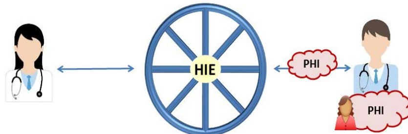
Figure 3: QA/QI Scenario

other electronic method requires HIPAA Security Rule compliance. This scenario works for any CEs who participate in a health information exchange and is not limited to provider CEs.